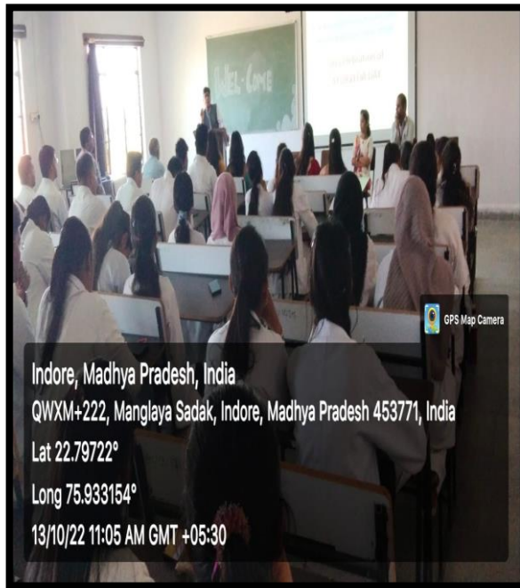
Indore, Madhya Pradesh, India QWXM+222, Manglaya Sadak, Indore, Madhya Pradesh 453771, India Lat 22.79722° Long 75.933154° 13/10/22 11:05 AM GMT +05:30