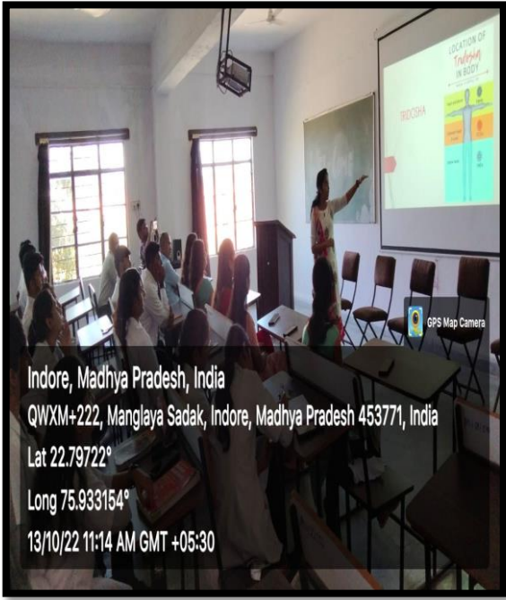
Indore, Madhya Pradesh, India QWXM+222, Manglaya Sadak, Indore, Madhya Pradesh 453771, India Lat 22.79722° Long 75.933154° 13/10/22 11:14 AM GMT +05:30