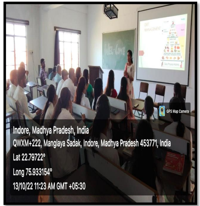
Indore, Madhya Pradesh, India QWXM+222, Manglaya Sadak, Indore, Madhya Pradesh 453771, India Lat 22.79722° Long 75.933154° 13/10/22 11:23 AM GMT +05:30